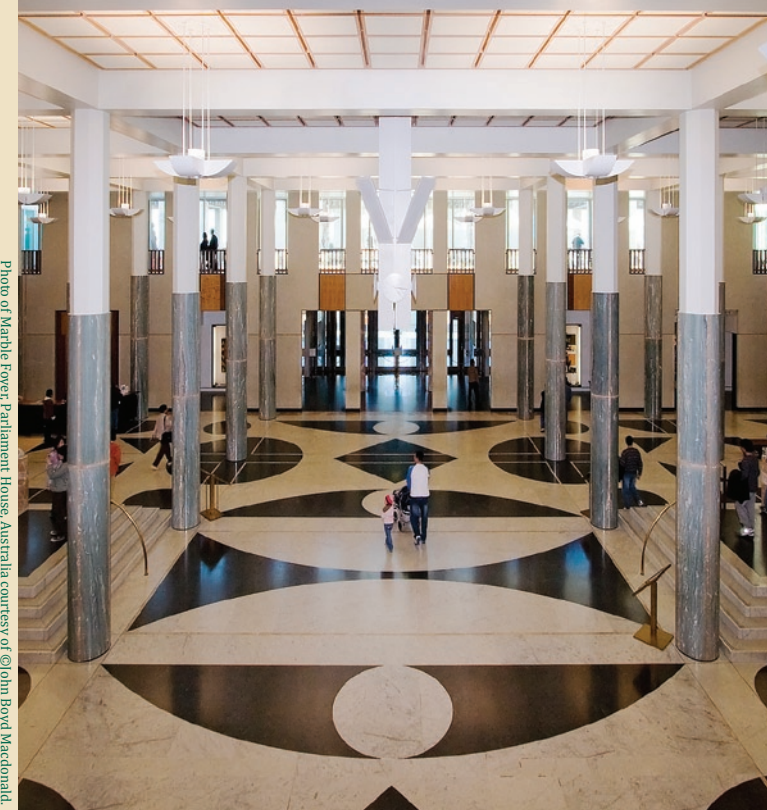
Photo of Marble Foyer, Parliament House, Australia courtesy of @John Boyd Macdonald